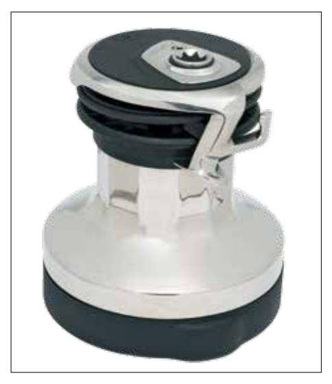
Stainless drum with flat faces makes for excellent grip.

Fast trim is a great advantage for the racing sailor as instant trim makes for higher boat speed. For the family cruising sailor, one handed operation means safety - no hands are even close to the drum when easing out the line. Single handed sailors can steer and trim at the same time.