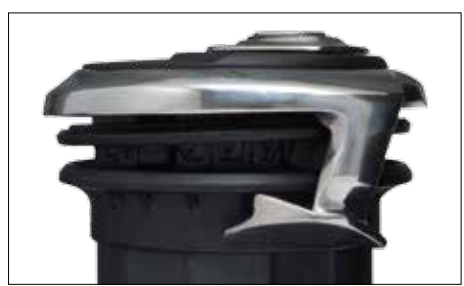
The groove of the self-tailer does not have the traditional wedge shape but is a round cavity encircling the line. A spring loaded disc provides just enough pressure to keep the line in place. The feeder arm is highly polished stainless steel.