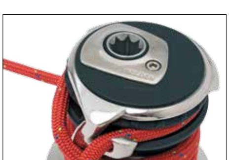
Compatible with all winch handles on the market, but only the Seldén winch handle offers