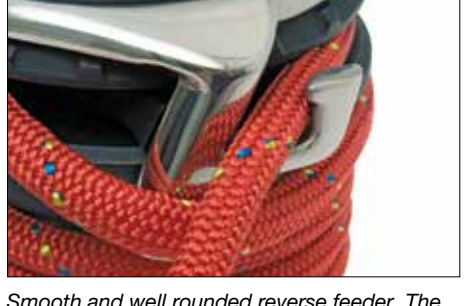
sheet can be dumped fast when tacking.