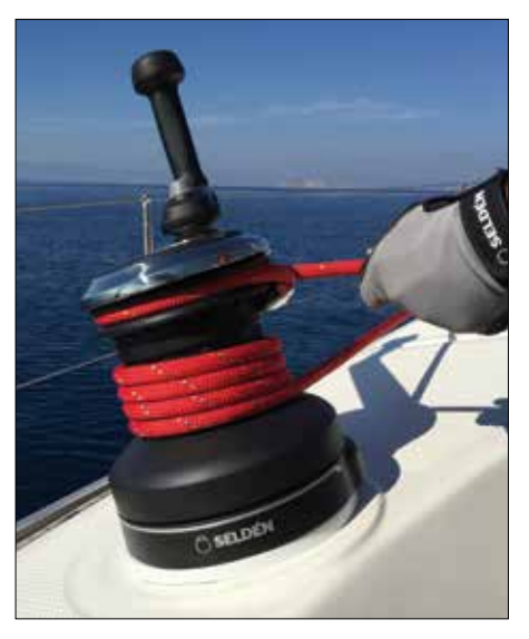
The grip on the drum and the ingenious self-tailer allow you to let the winch handle remain in the winch while pulling the slack. Check out the video.