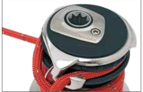
2-speed forward and 1-speed reverse.