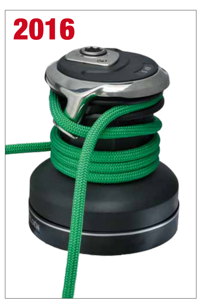
$30, $40, $48, $54