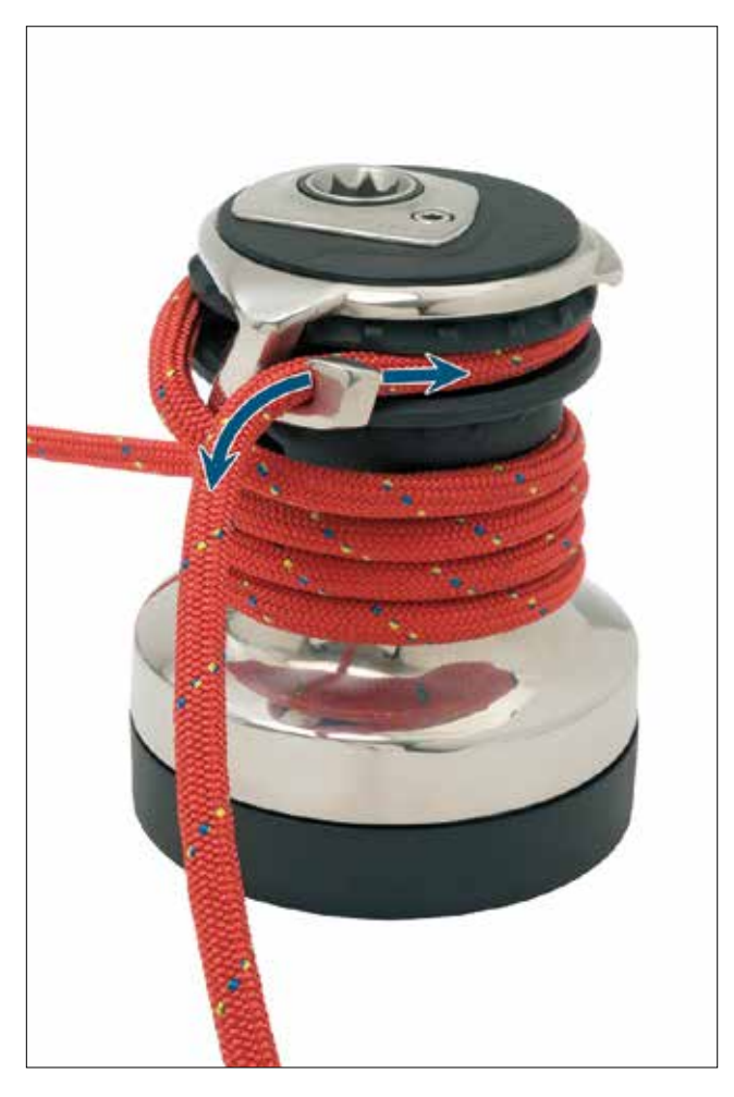
R30, R40, R46, R52