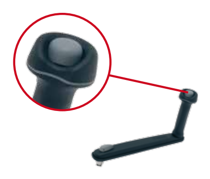
Unique and patented reverse function operated with a push of your thumb.

Innovation Award 2011, Racing gear category.