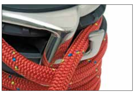
Smooth and well rounded reverse feeder. The