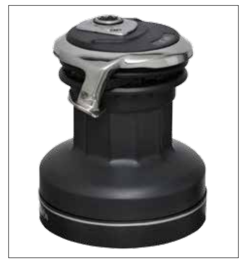
The drum is hard anodised aluminium with concave surfaces that provide the extraordinary grip.

The cruising sailor will appreciate simpler and safer maneuvers by not having to hold a tensioned sheet in the hand whilst trying to load it into the self-tailer and searching around for the winch handle.