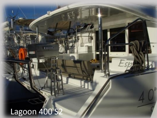
Lagoon 400 S2