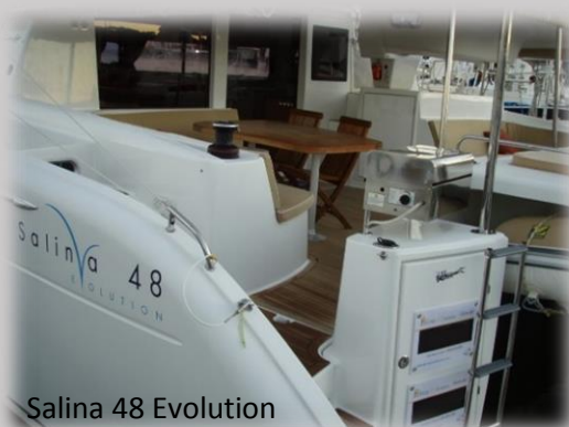
Salina 48 Evolution